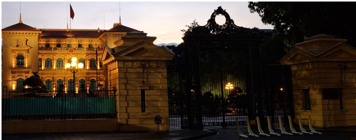
Photo20: Presidential Palace; Hanoi.

Later the delegates enjoyed shopping by the lake side avenues and later had dinner at Indian Restaurant.