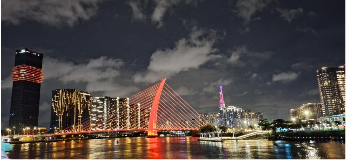
Photo 16: View of Saigon bridge and skyline from the river cruise.