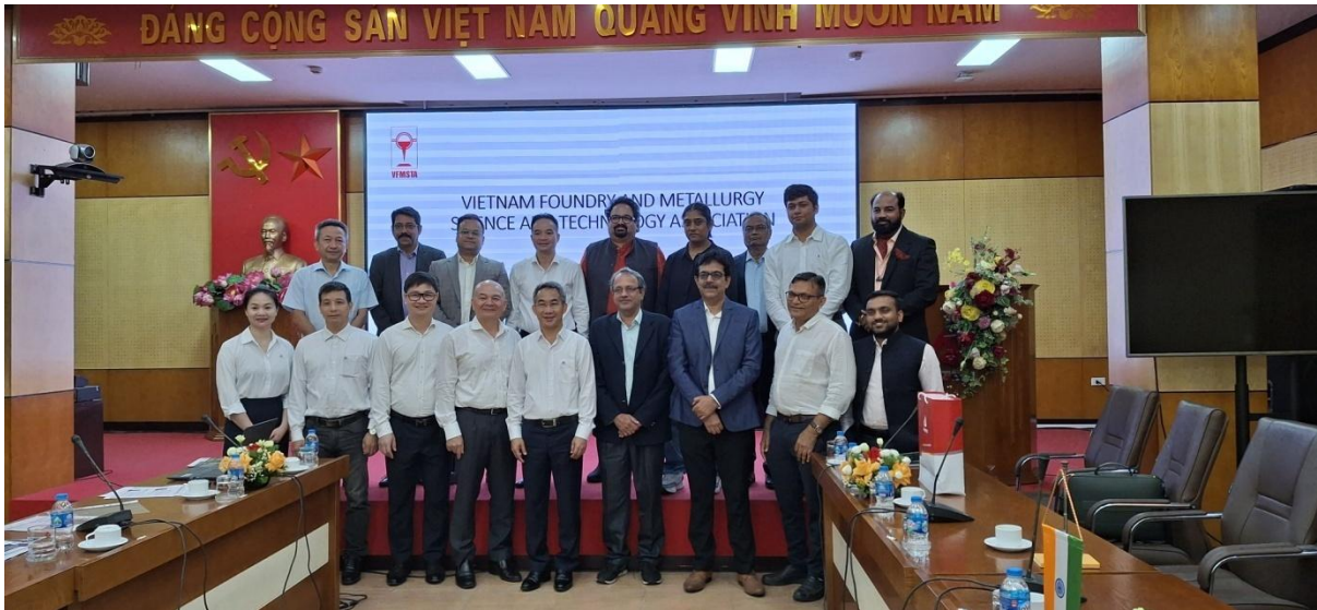
Photo23: Group Photo after B2B meeting with VMFA

Third B2B meeting was with Industries development Council (IDC) founded by Ministry of Industries and Trade, Government of Vietnam.