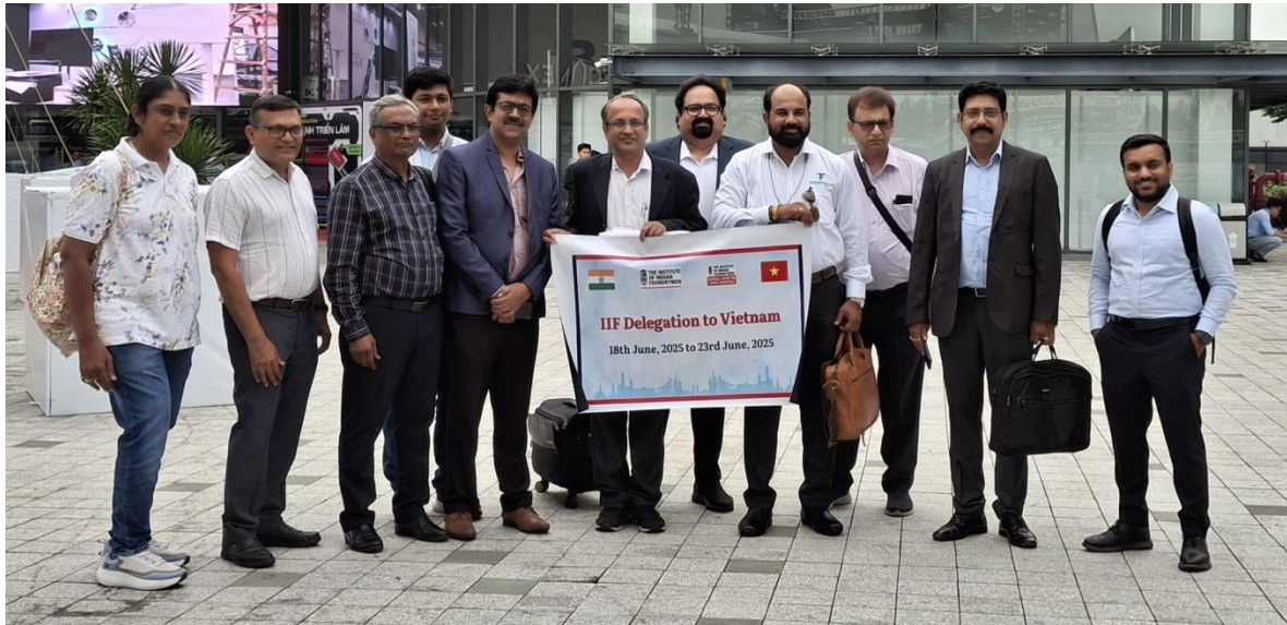
Photo1: At the entrance of World Trade Center Binh Duong.

The exhibition was about overall manufacturing industries in Vietnam.